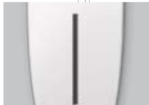
FANATIC VIPER DAGGERBOARD BOX