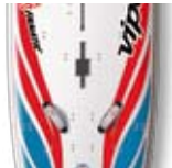
SOFTDECK COVERS THE WHOLE DECK AREA