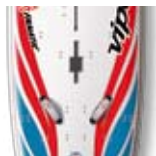
SOFTDECK COVERS THE WHOLE DECK AREA